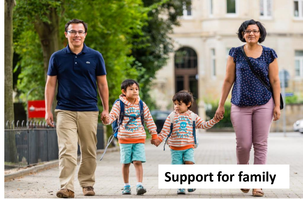
Support for family